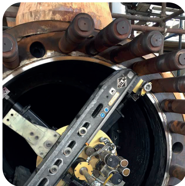
Machining of gasket surfaces on a shell-and-tube heat exchanger using a custom-built boring machine.

Customized to your priorities and requirements, a service agreement can include any of our services. It is the ideal maintenance solution from the original manufacturer of your equipment.